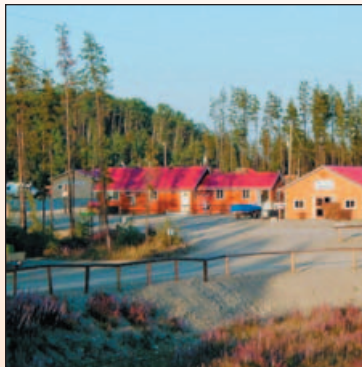
Meeting Room for Large Groups By Reservation