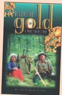
Collector copy of family book available.