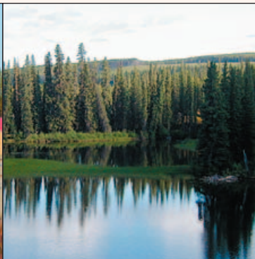
Walk to Lake for Fishing, Bird & Wildlife Viewing