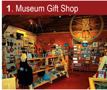
1. Museum Gift Shop

MacBride Museum tells fascinating stories of the people and events that built Canada's Yukon