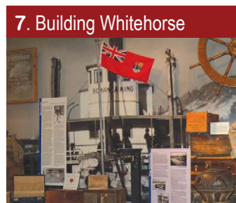
7. Building Whitehorse