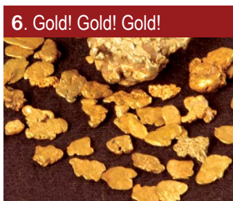
6. Gold! Gold! Gold!