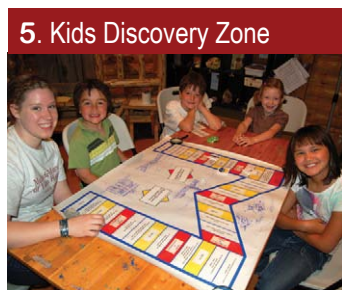
5. Kids Discovery Zone