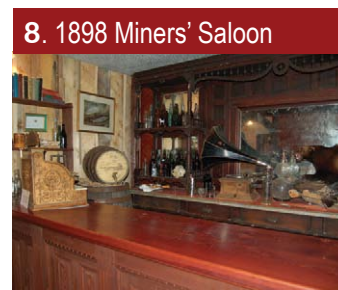
8. 1898 Miners' Saloon