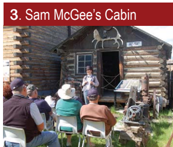
3. Sam McGee's Cabin