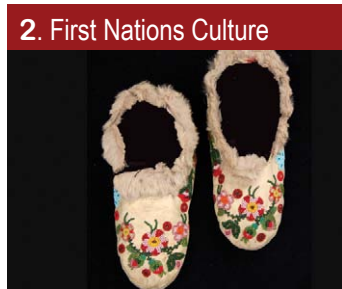
2. First Nations Culture