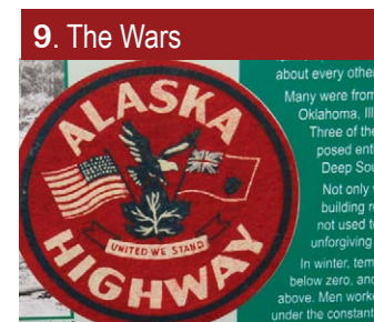
9. The Wars