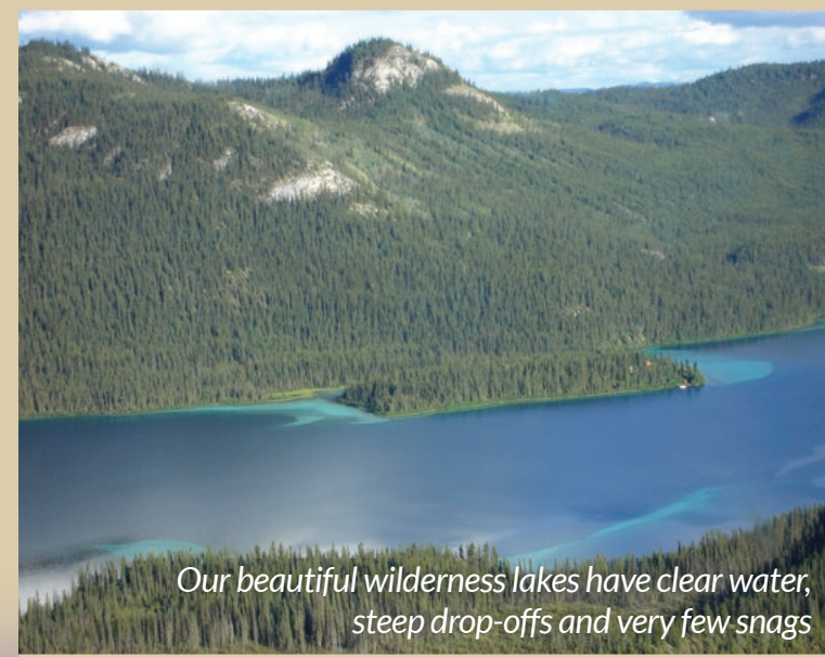
Our beautiful wilderness lakes have clear water, steep drop-offs and very few snags

FLY FISHING FOR LAKE TROUT ARCTIC GRAYLING, NORTHERN PIKE & WHITEFISH Fly fishing enthusiasts have discovered great sport catching Trout, Grayling, and Northern Pike on both dry and wet lines. Anglers who discover what the whitefish are biting end up having hours of enjoyment and very tired arms!