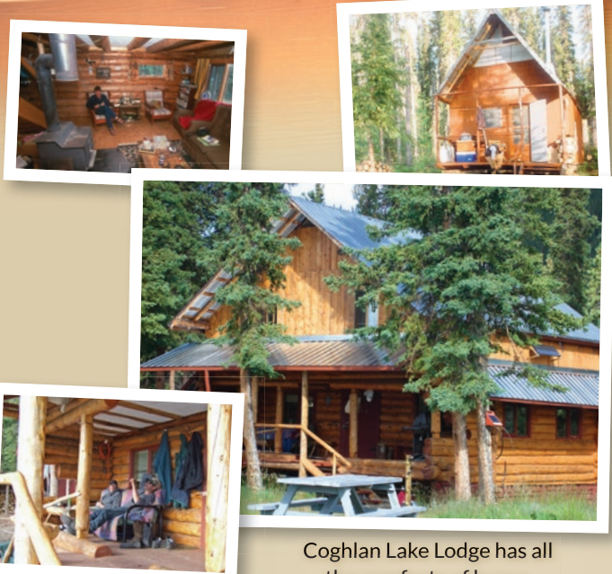
Coghlan Lake Lodge has all the comforts of home.