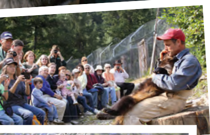
Kitty the Grizzly