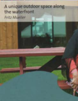
A unique outdoor space along the waterfront