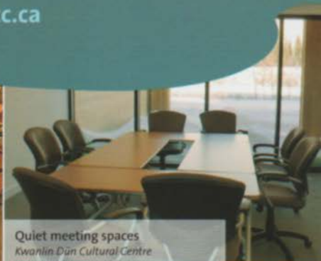
Quiet meeting spaces Kwanlin Dün Cultural Centre