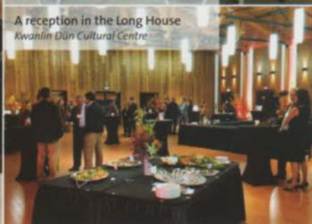
A reception in the Long House Kwanlin Dün Cultural Centre