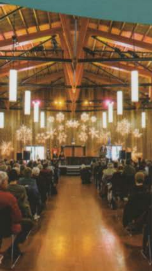
Spacious rooms for large events The Commissioner's Office

For more details on booking the perfect space go to: www.kdcc.ca