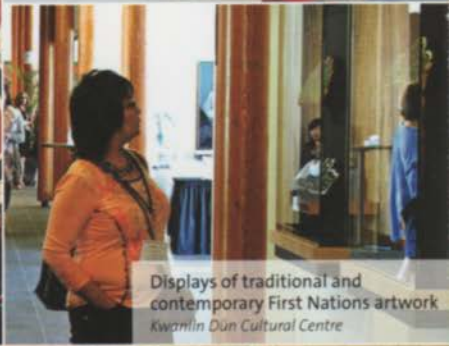
Displays of traditional and contemporary First Nations artwork Kwanlin Dün Cultural Centre