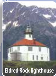
Eldred Rock lighthouse