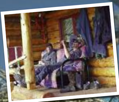
Coghlan Lake Lodge has all the comforts of home.