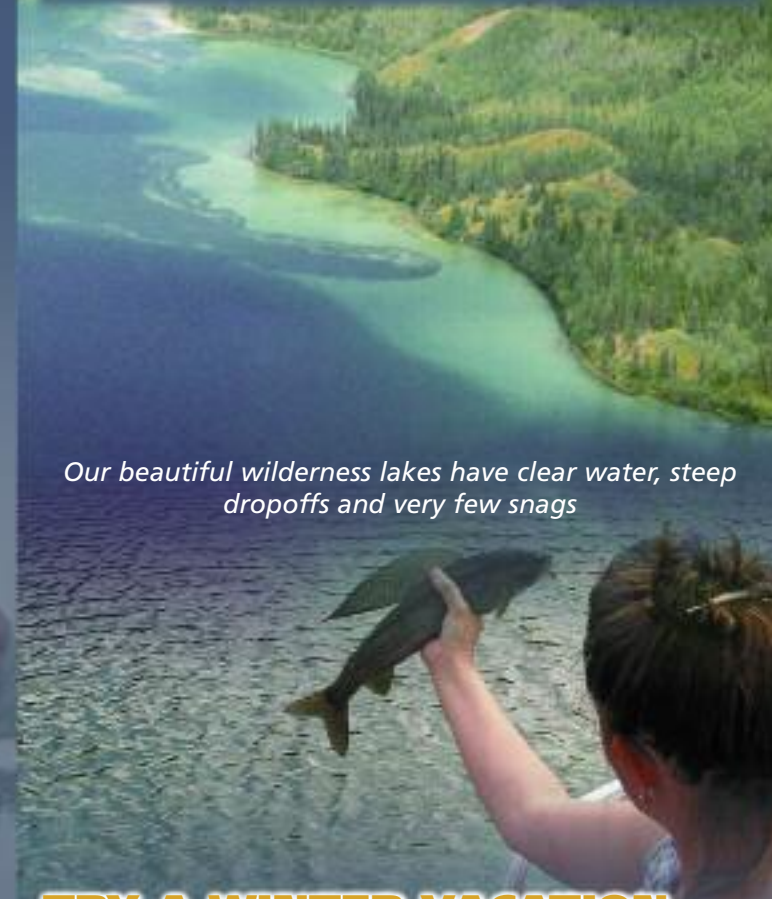
Our beautiful wilderness lakes have clear water, steep dropoffs and very few snags

Fly fishing enthusiasts have discovered great sport catching Trout, Grayling, and Northern Pike on both dry and wet lines. Anglers who discover what the whitefish are biting end up having hours of enjoyment and very tired arms!